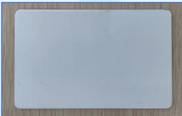
Use special reader and test card